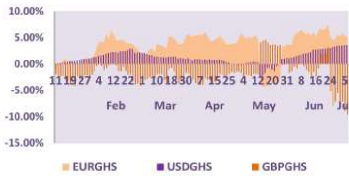
Fig 3: YTD performance of Pound, Dollar & Euro versus the Cedi

At the close of trading however, the Cedi trimmed down its year-to-date loss from 2.01% to 1.65% on Thursday.